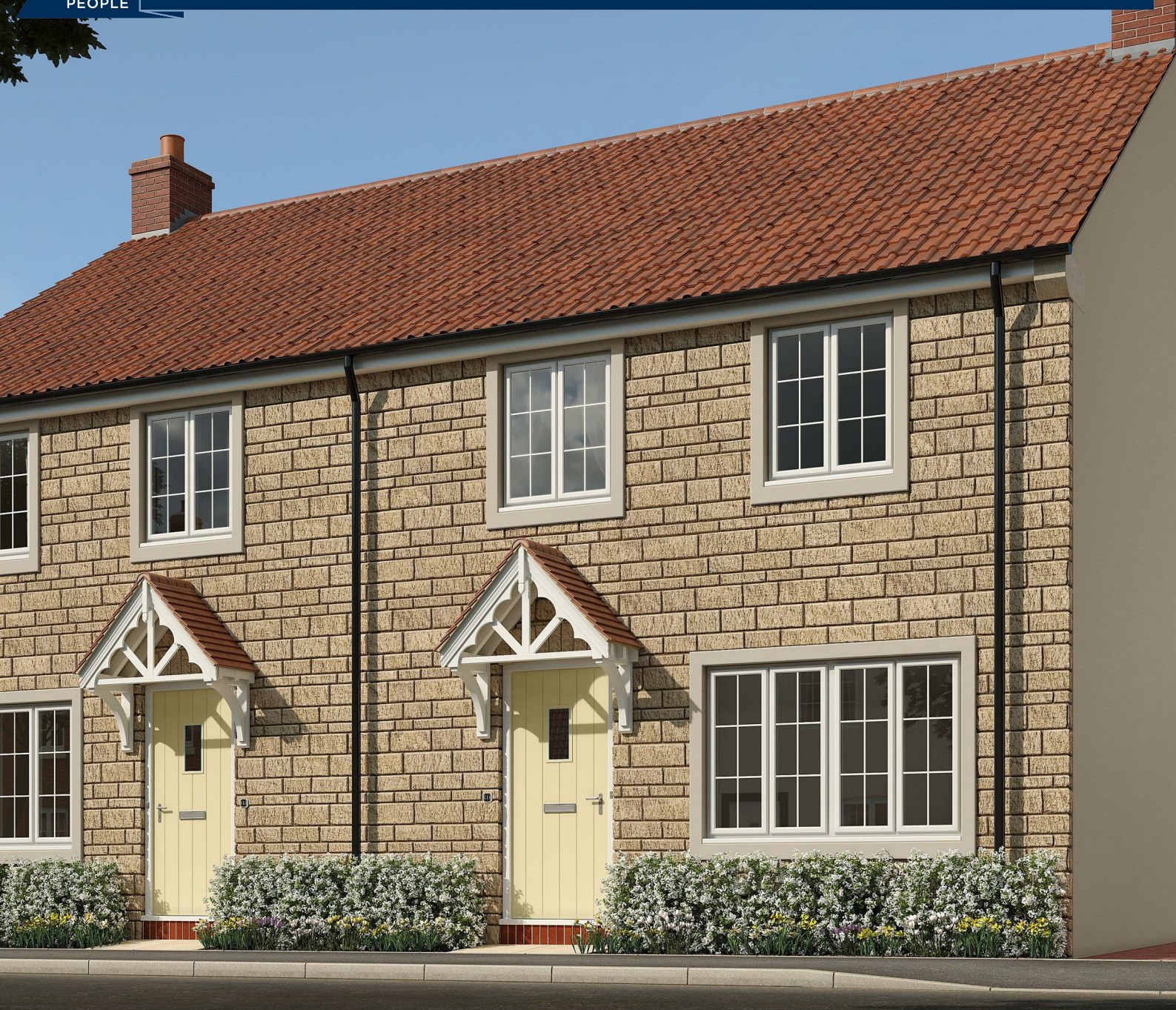
Stoke Meadow Calne