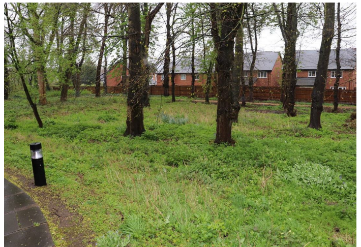
View To Rear