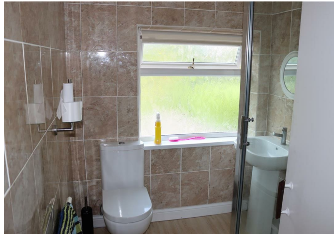
Modern Shower Room