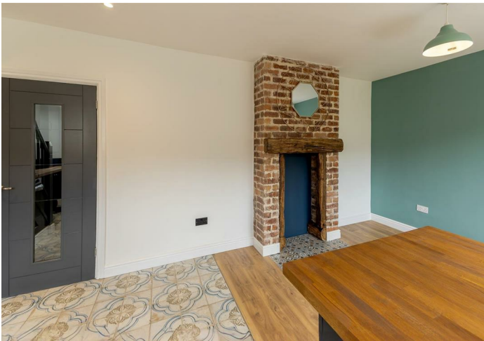
Luxury Fitted Dining/Kitchen