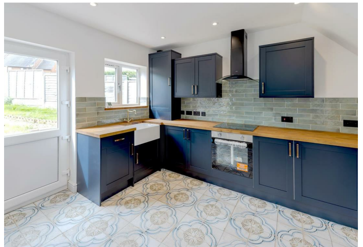
Luxury Fitted Dining/Kitchen