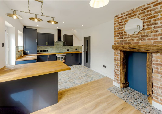
Luxury Fitted Dining/Kitchen