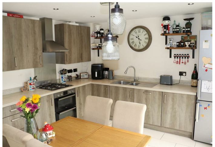
Luxury Fitted Kitchen / Diner