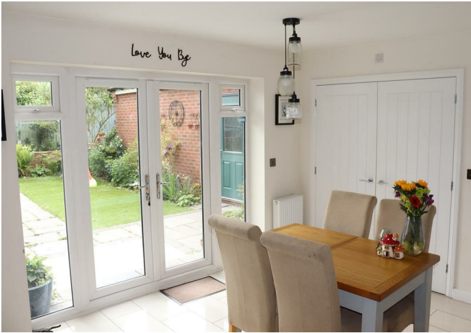
Luxury Fitted Kitchen / Diner