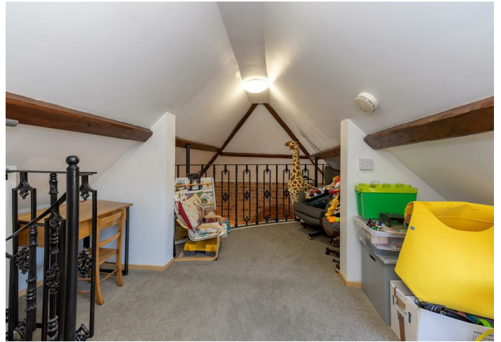
Mezzanine Sitting Room