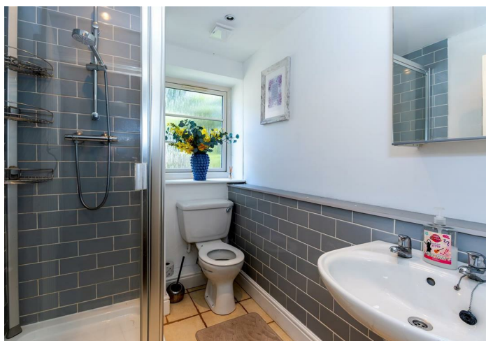
Ground Floor Shower Room