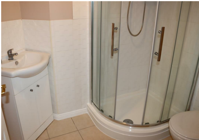
En Suite Shower Room