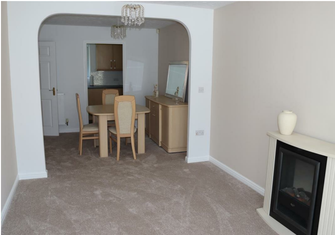
Through Lounge/Dining Room