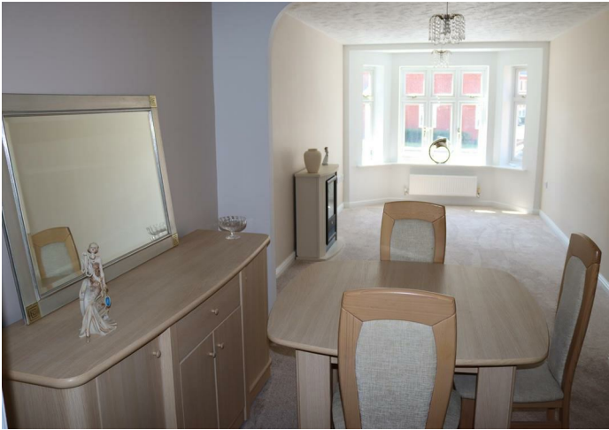
Through Lounge/Dining Room