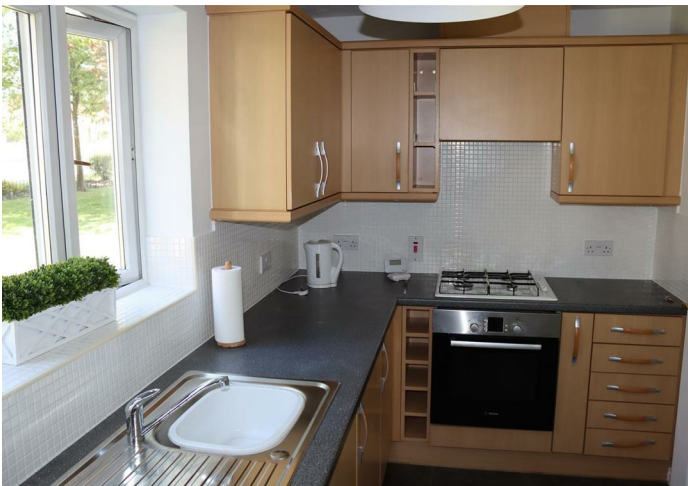
Modern Fitted Kitchen