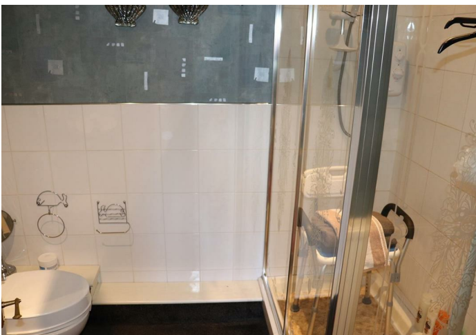
En Suite Shower Room