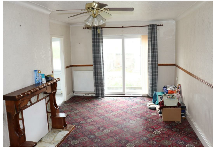
Lounge / Diner