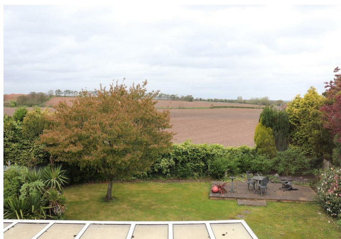
View To Rear