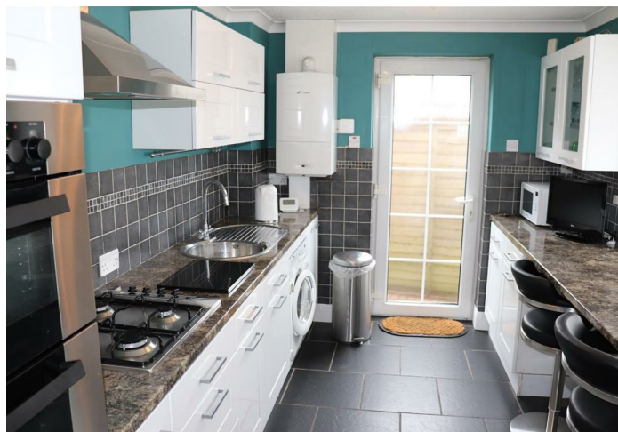
Luxury Fitted Kitchen