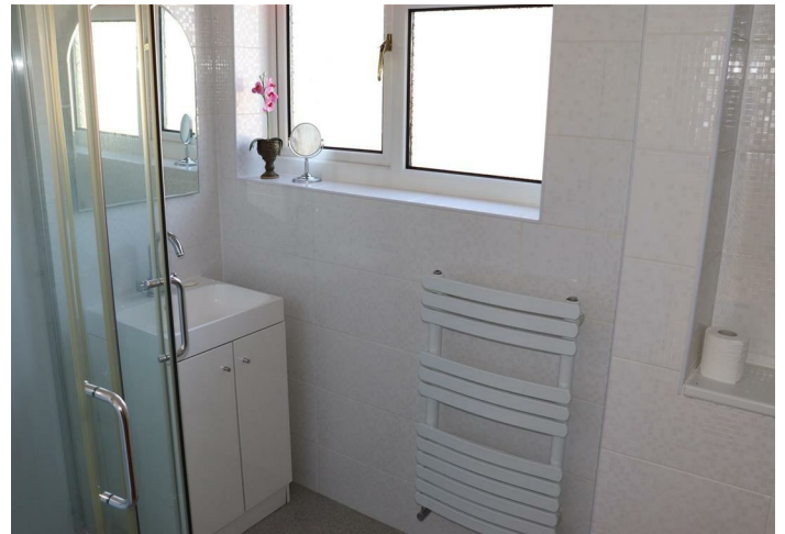
Modern Shower Room