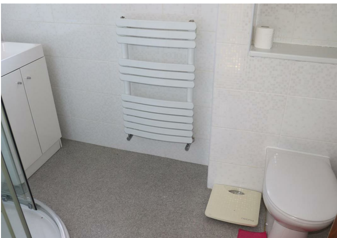
Modern Shower Room