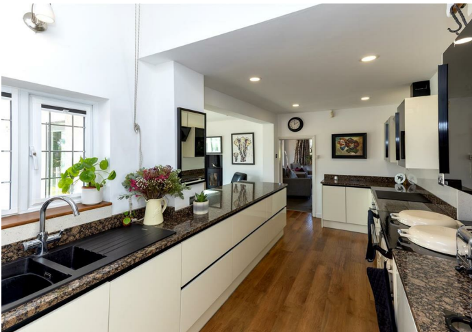
Stunning Open Plan Kitchen/Family Space/Conservatory