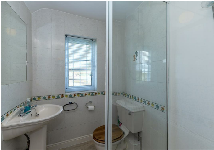
En Suite Shower Room