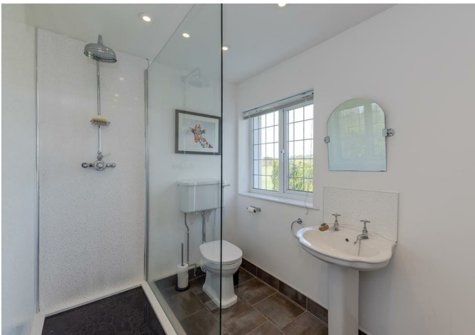
En Suite Shower Room