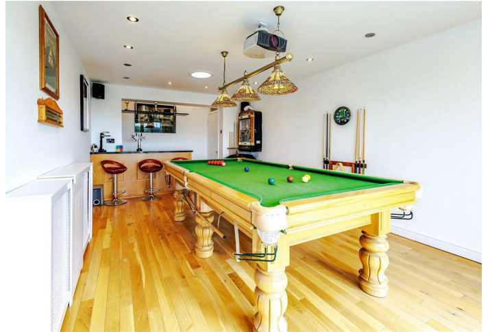
Bedroom Four/Games Room