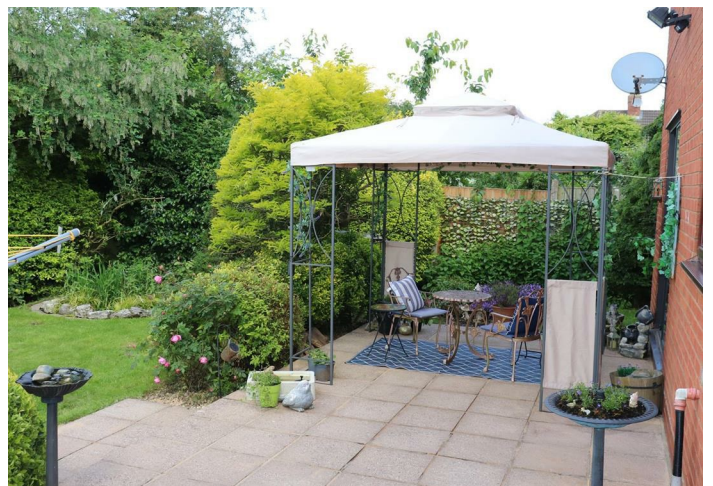
Private Rear Garden