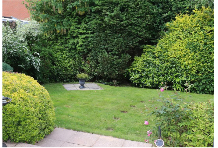
Private Rear Garden