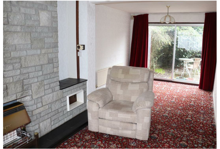
Through Lounge/Dining Room