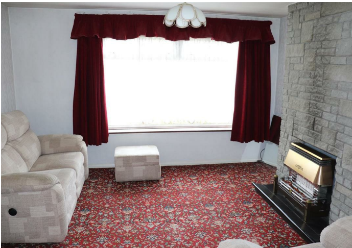
Through Lounge/Dining Room