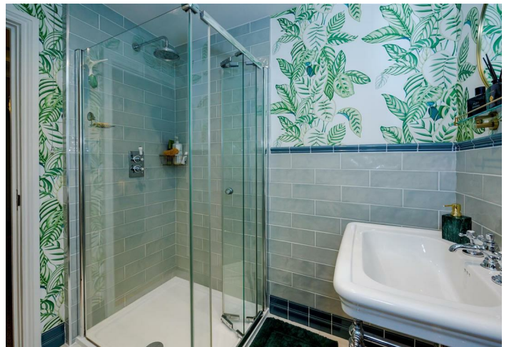
Luxury Shower Room