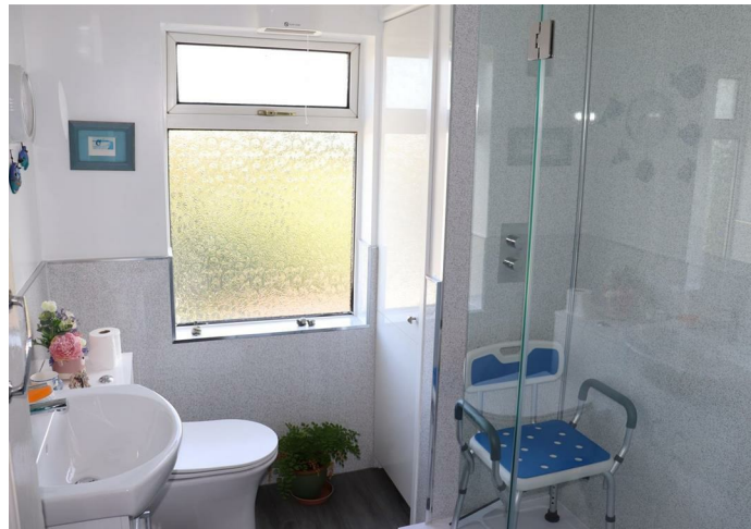
Modern Shower Room