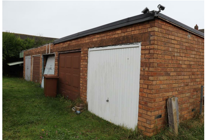
Garages To Rear