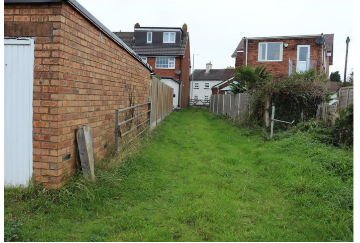
Access To Garages