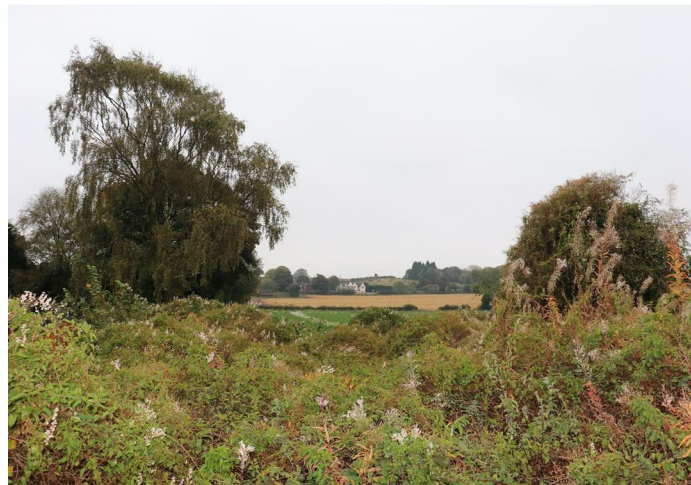
Open Aspect To Rear