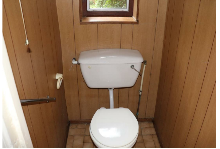
Ground Floor WC