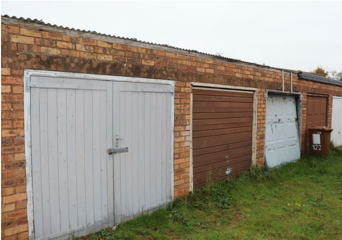
Garages To Rear