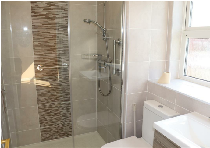
Luxury En Suite