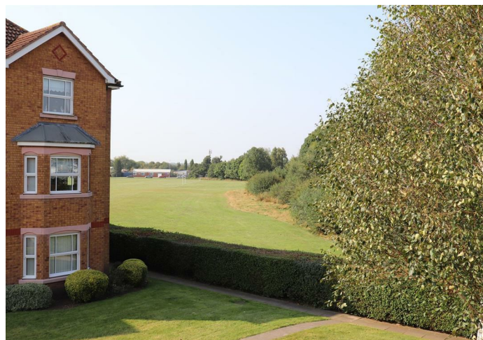
View Towards Anchor Meadow