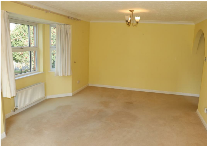
Impressive Lounge/Dining Room