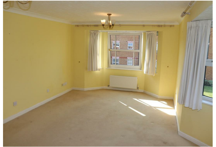
Impressive Lounge/Dining Room