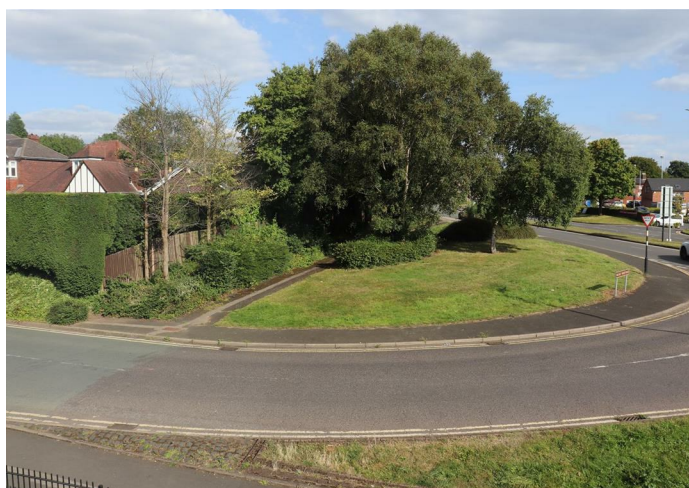
View to Front