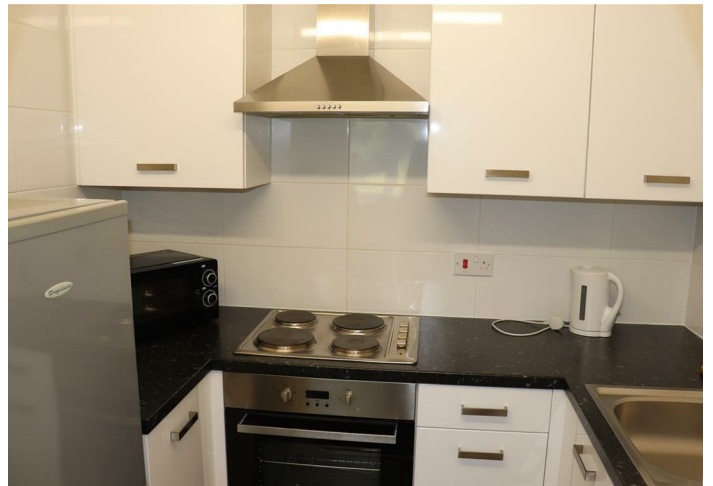
Luxury Refitted Kitchen