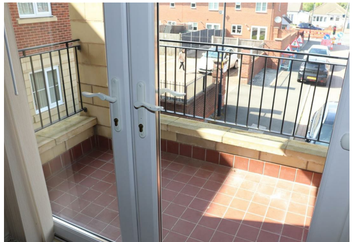
Balcony Off Lounge