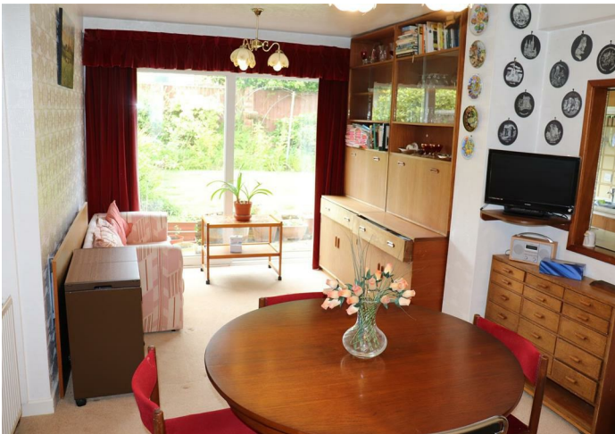
Extended Dining Room