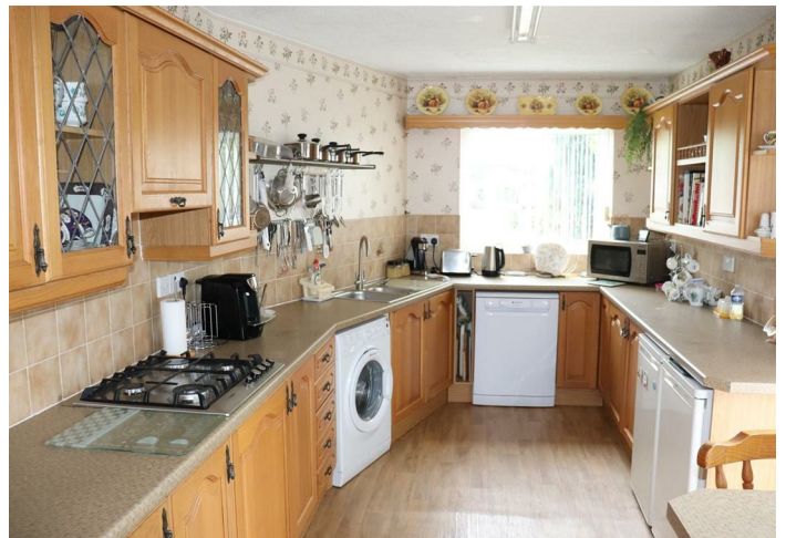
Extended Fitted kitchen