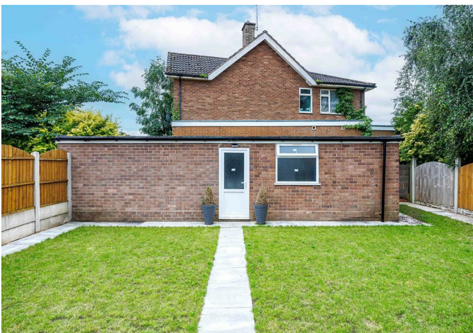
Main Garden and Garage