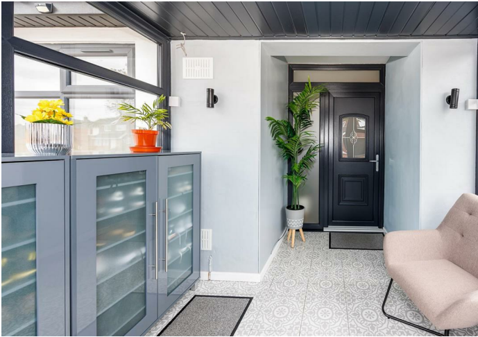
Fully Enclosed Porch