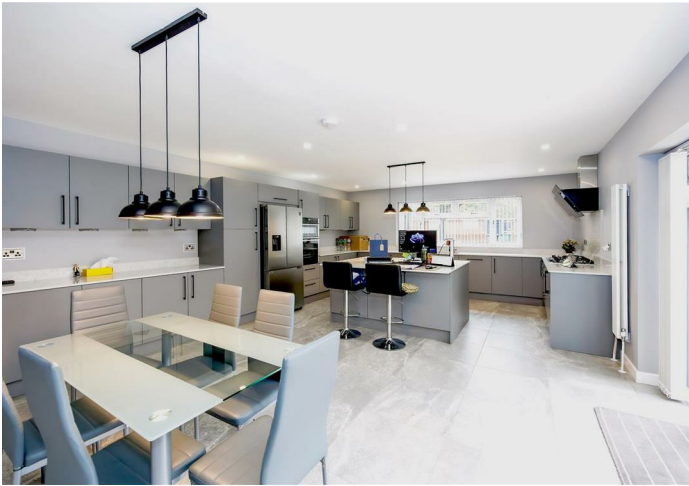
Superb Dining/Kitchen/Family Room