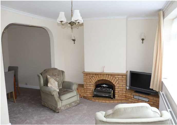
Lounge / Dining Room