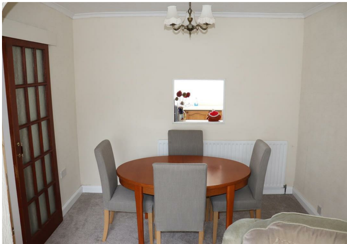
Lounge / Dining Room