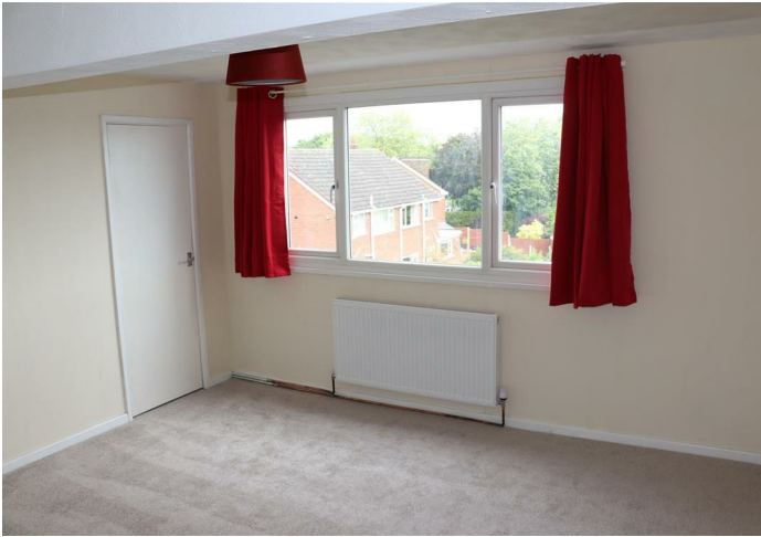
Loft Room / Bedroom Four