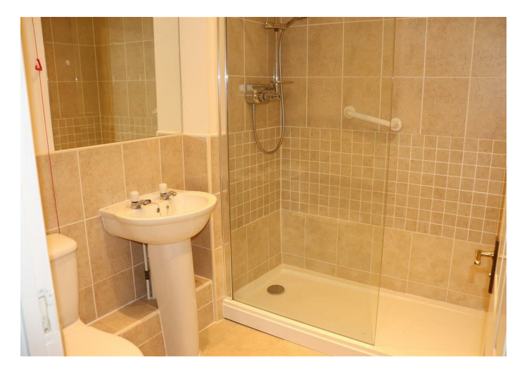
Modern Shower Room