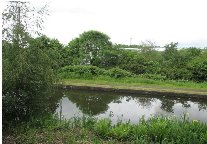
View To Rear