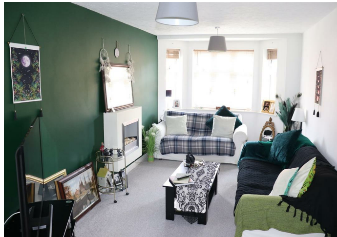
Through Lounge/Dining Room