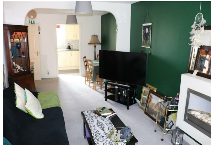
Through Lounge/Dining Room