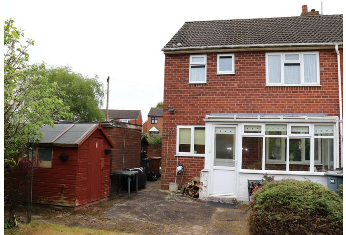
Rear Garden / Rear Elevation