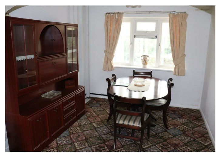
Through Lounge/Dining Room