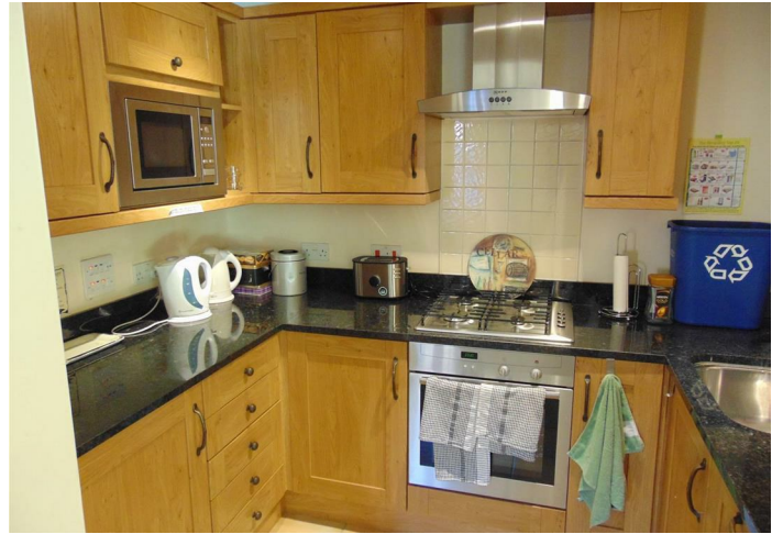
Residents Lounge And Kitchen Facility