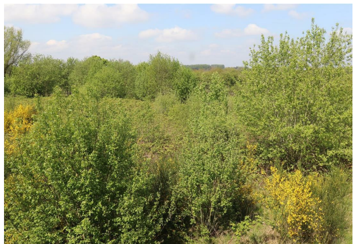
View To Rear