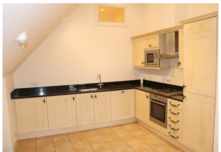
Open Plan Lounge/Dining/Kitchen