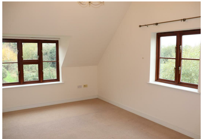
Open Plan Lounge/Dining/Kitchen