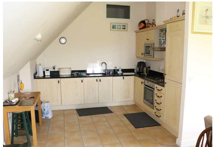
Open Plan Lounge/Dining/Kitchen