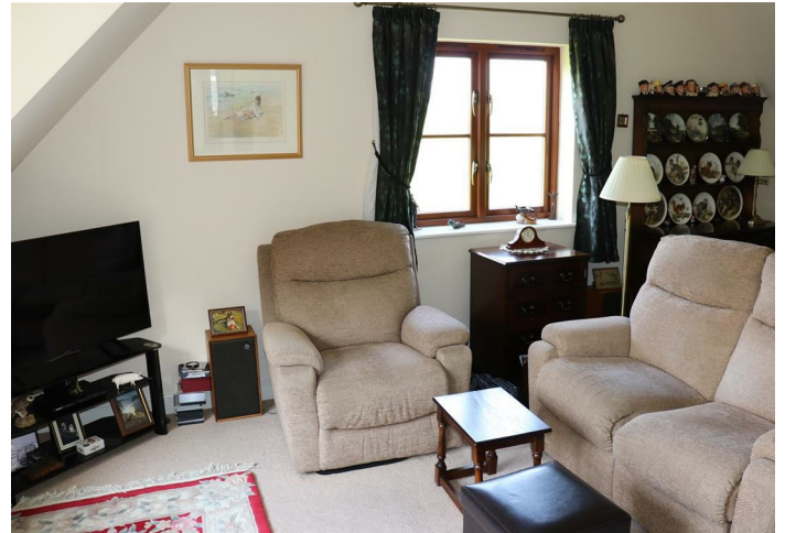
Open Plan Lounge/Dining/Kitchen