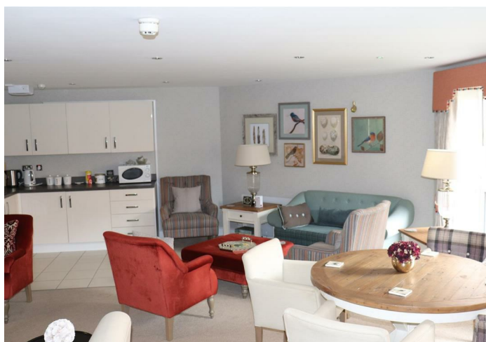
Residents Lounge and Kitchen Facility