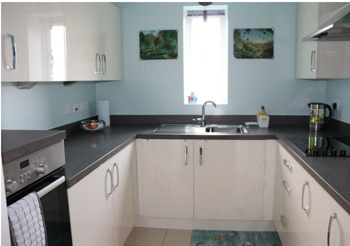
Luxury Fitted Kitchen