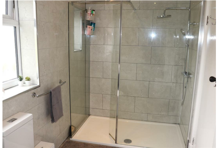
Luxury Family Bathroom