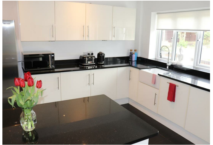
Superb Dining/Kitchen/Family Room