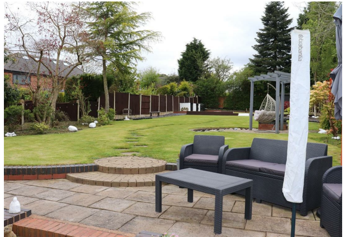
Large Landscaped Rear Garden