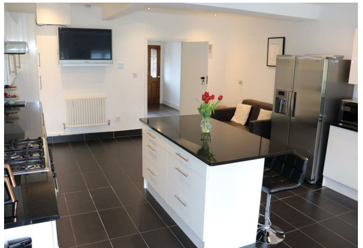
Superb Dining/Kitchen/Family Room