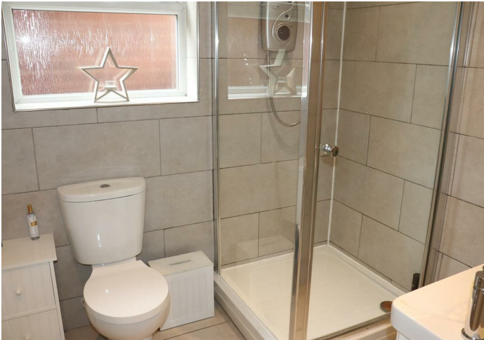
Ground Floor Shower Room