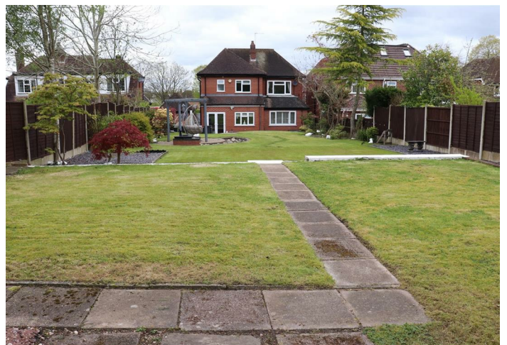
Rear Garden/Rear Elevation