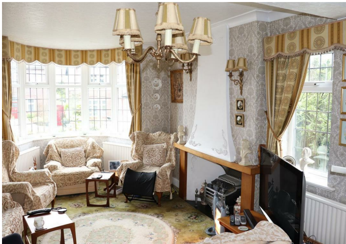
Through Lounge/Dining Room