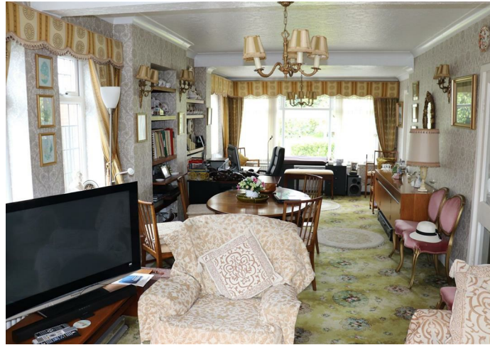
Through Lounge/Dining Room