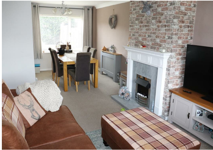
Through Lounge/Dining Room