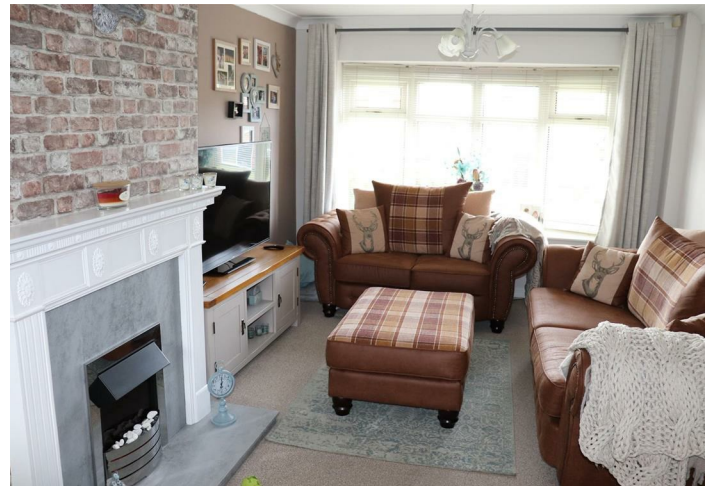
Through Lounge/Dining Room