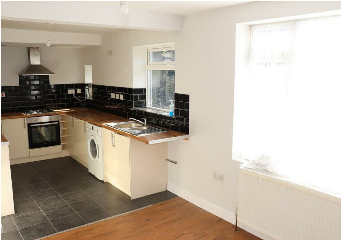
Modern Fitted Dining / Kitchen