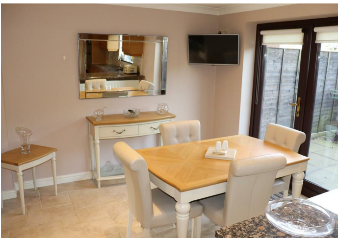
Luxury Fitted Dining/Kitchen