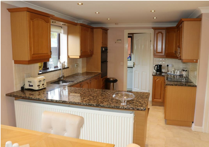
Luxury Fitted Dining/Kitchen