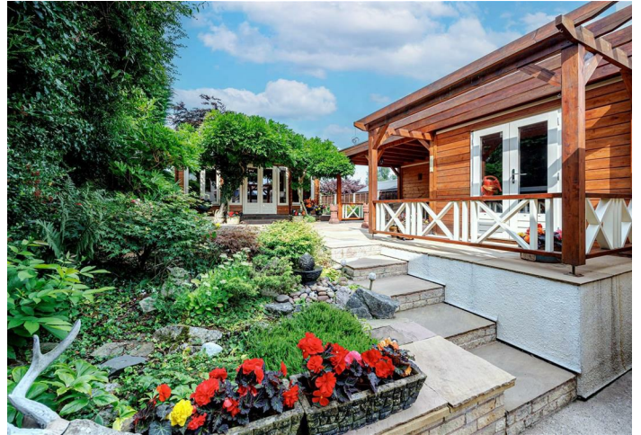
Rear Patio Area