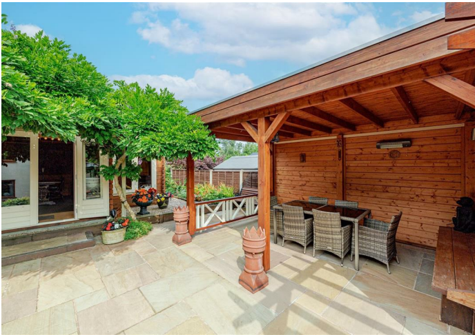
Rear Patio Area