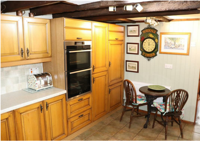
Modern Fitted Kitchen