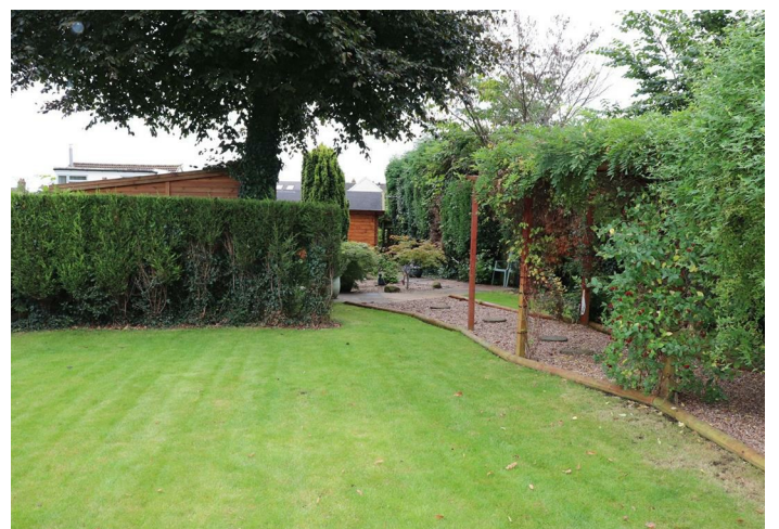
Further Rear Garden