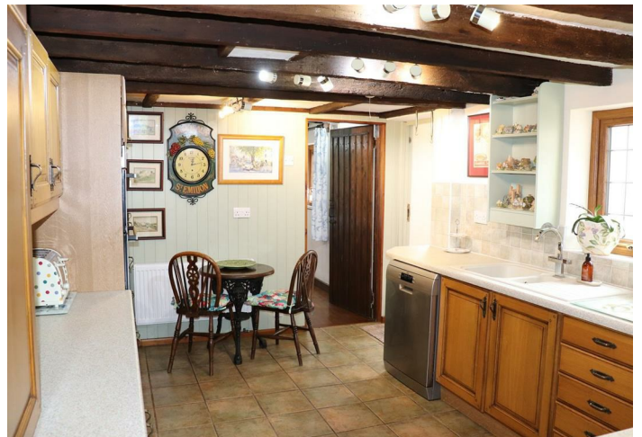
Modern Fitted Kitchen