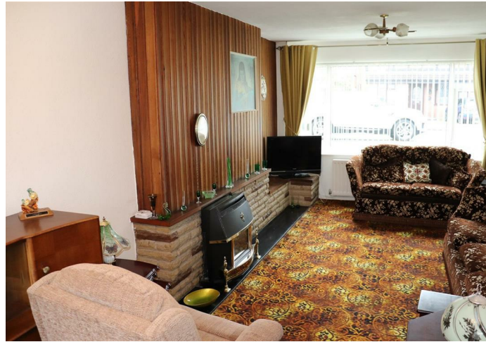
Through Lounge/Dining Room