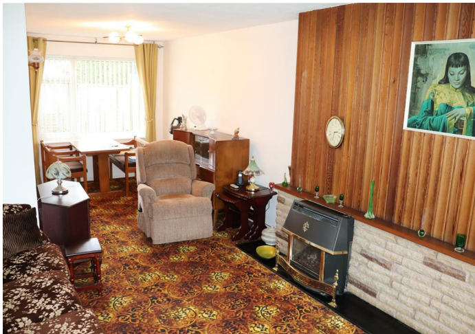
Through Lounge/Dining Room