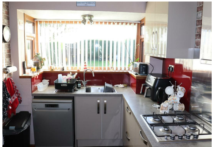
Modern Fitted Kitchen