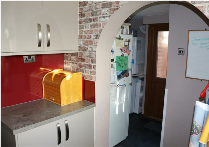
Modern Fitted Kitchen