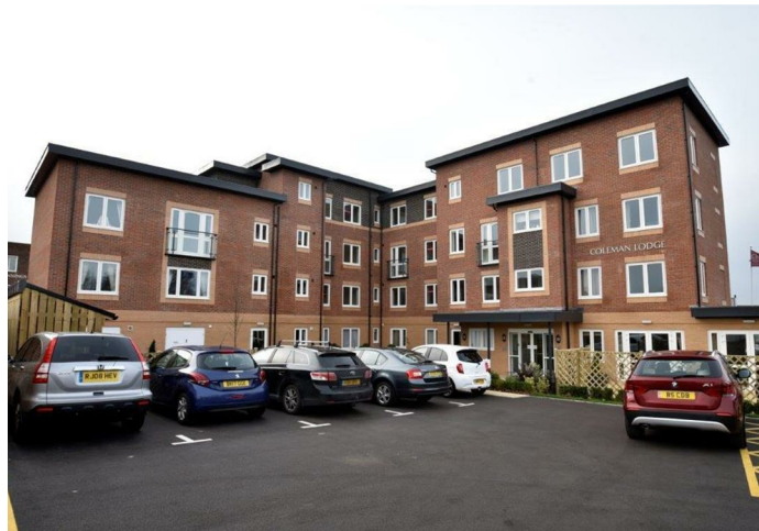
Rear Elevation / Residents Car Park