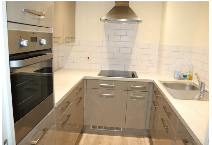
Luxury Fitted Kitchen