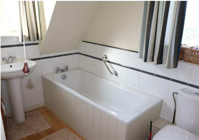
First Floor Bathroom