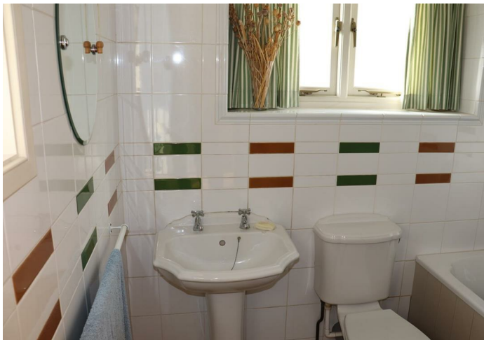
Ground Floor Bathroom