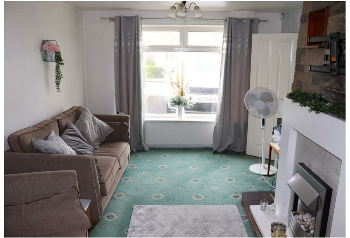
Through Lounge/Dining Room