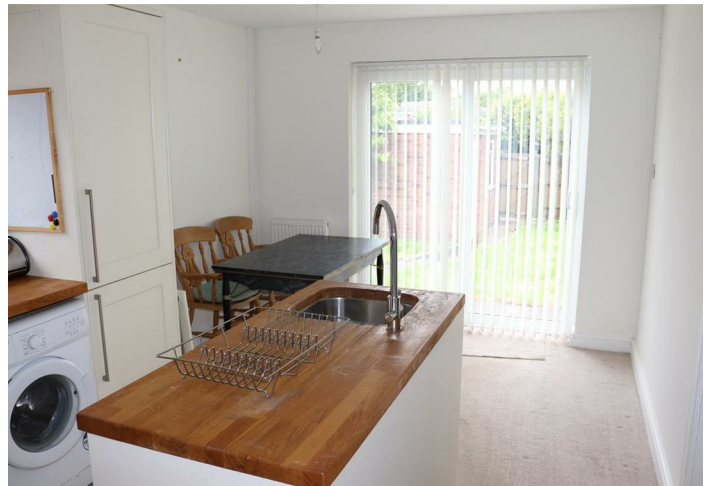
Modern Fitted Dining/Kitchen