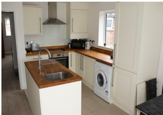
Modern Fitted Dining/Kitchen