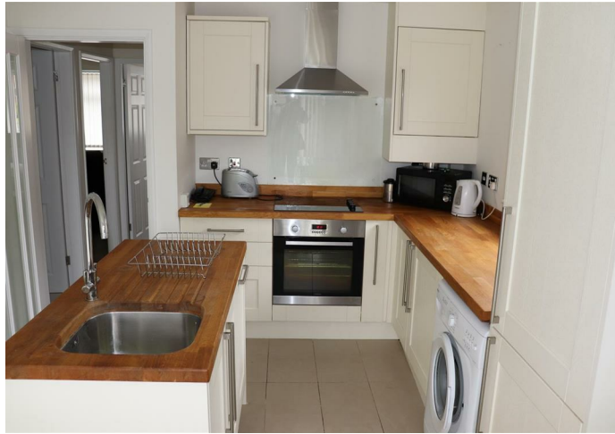
Modern Fitted Dining/Kitchen