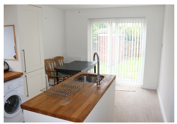
Modern Fitted Dining/Kitchen