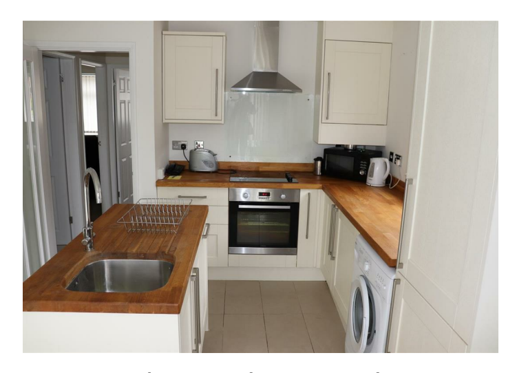
Modern Fitted Dining/Kitchen