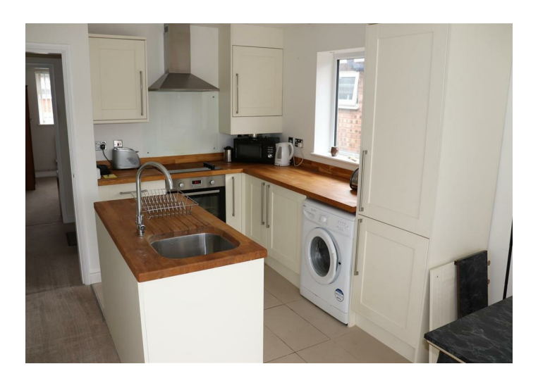
Modern Fitted Dining/Kitchen