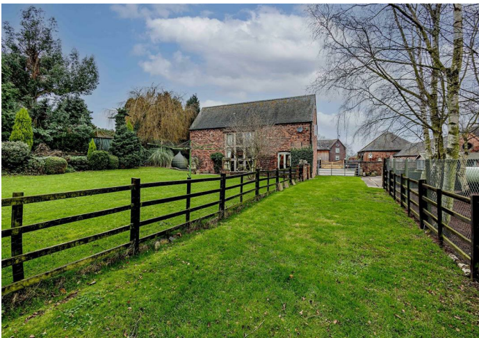
Rear Garden/Rear Elevation