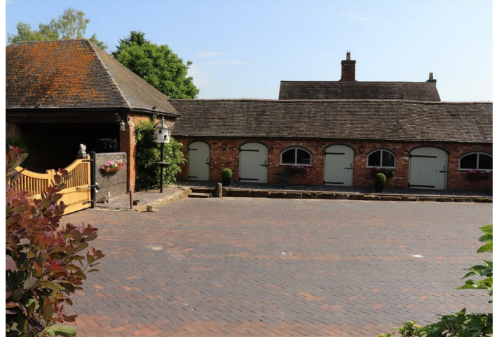
Outbuildings and Courtyard/Driveway Providing parking for around 15 vehicles