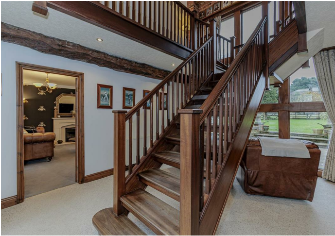
Reception Hall/Sitting Area