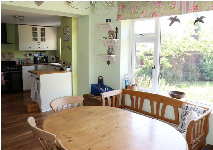
Family Dining Kitchen