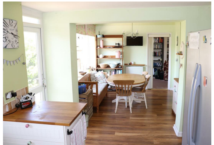
Family Dining Kitchen