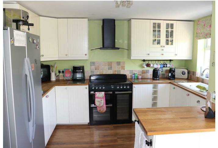
Family Dining Kitchen