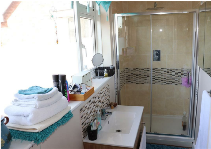
En Suite Shower Room