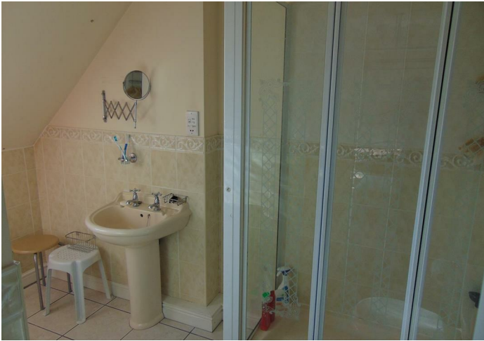
En Suite Shower Room