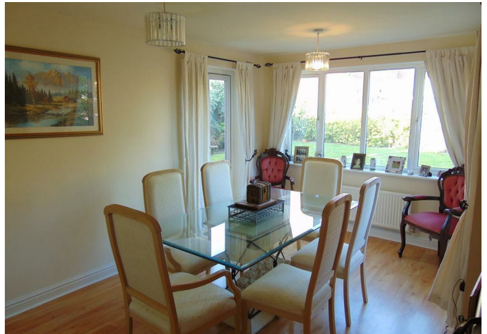
Fitted Dining/Kitchen/Family Room