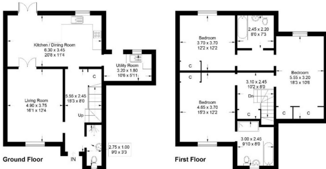
Illustration for identification purposes only, measurements are approximate, not to scale. Fourisbs.co © (ID1204189)

Approximate Gross Internal Area = 138.3 sq m / 1489 sq ft